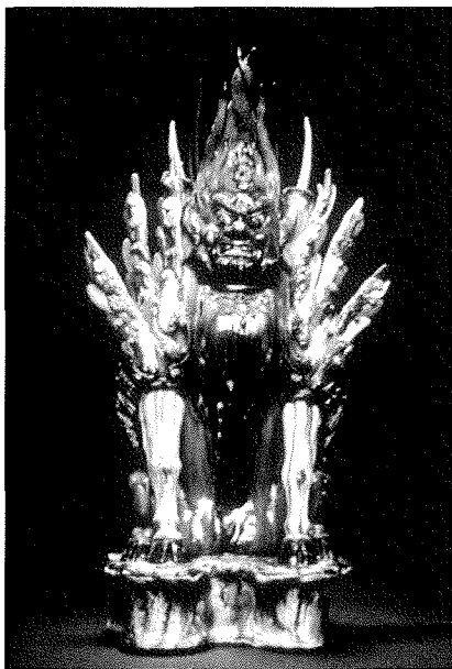
Human Head Tomb Guardian Chinese, late 7th or early 8th century Tang Dynasty, Ceramic ( sancai ware) The Cleveland Museum of Art

ASIANetwork Spring Board of Directors Meeting - Director "B"